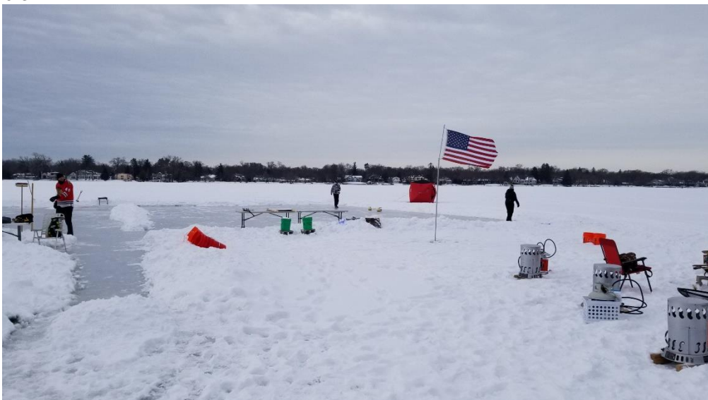
Oh say, can you see?

1 hour to go before showtime: the team runs final system checks. The men's room is ready. Last night was not as cold as we would have liked, but the red circles have frozen! The wind must have helped with the freezing process. The mood changes from fretting to giddiness – for most of us. Steve calculates how to set up a 1-square-mile windscreen. It will be difficult. It will be REALLY difficult without that drill bit.