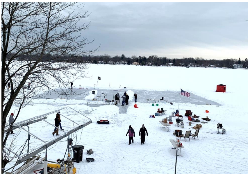
View from the Eagle's Nest

Remember last year when I won? That was awesome.