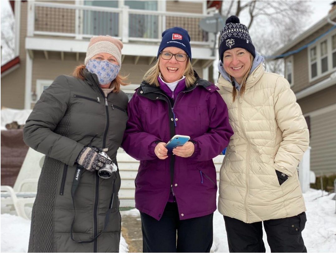
Guardians of the women's restroom.